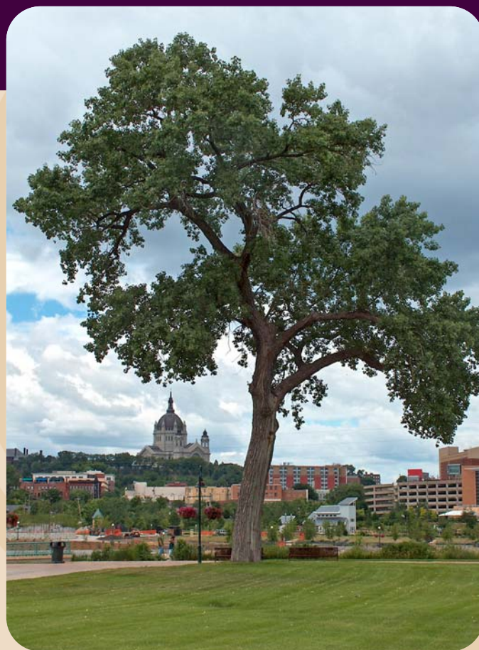
ST. PAUL CATHEDRAL FROM RIVERFRONT