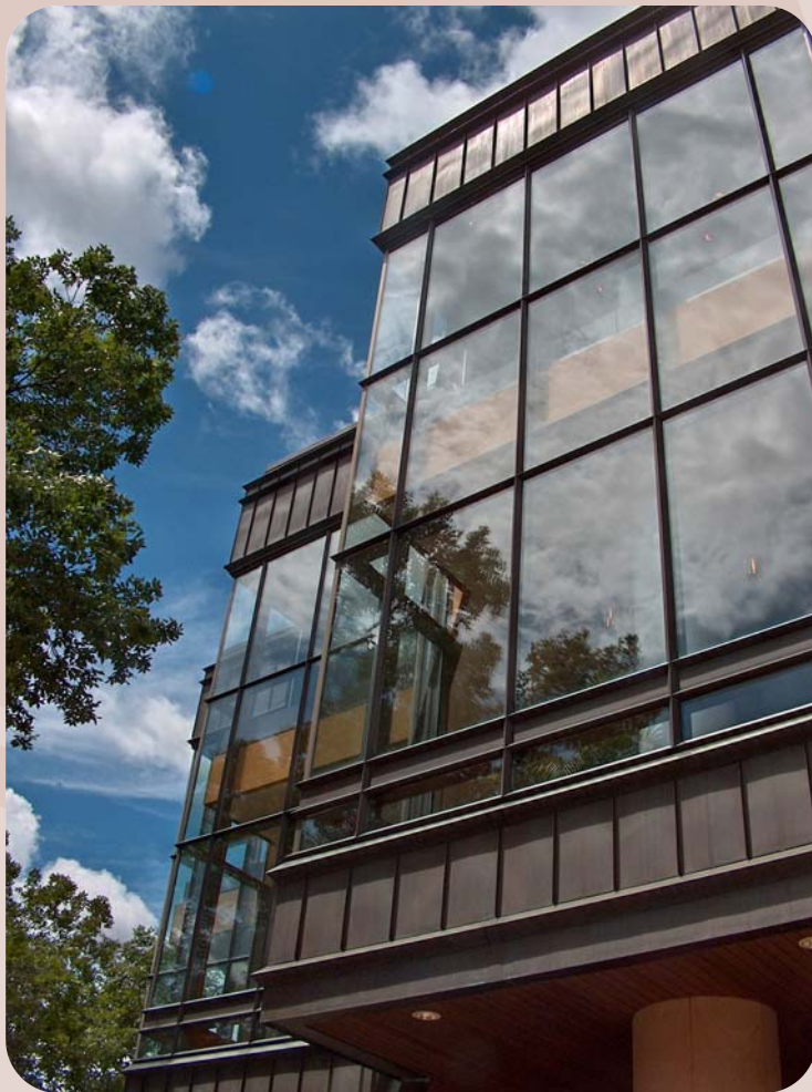
ORDWAY CENTER FOR THE PERFORMING ARTS

The 22nd Annual National Meeting on Alcohol and Other Drug Abuse and Violence Prevention in Higher Education and the National Forum for Senior Administrators, the premiere event for higher education professionals, will focus this year on Ensuring the Safety and Well-being of Our Students: Widening the Lens of Prevention . This theme reinforces the wide array of issues that face college campuses in prevention today, including alcohol and other drug abuse, violence, mental health, and emergency preparedness and management. The National Meeting's plenary sessions, workshop and poster sessions, and town meetings will highlight the need for campus- and community-based practitioners to use evidence-based prevention and early intervention strategies in preventing alcohol and other drug abuse and violent behavior among college students and ensuring the health and safety of all students on campus.