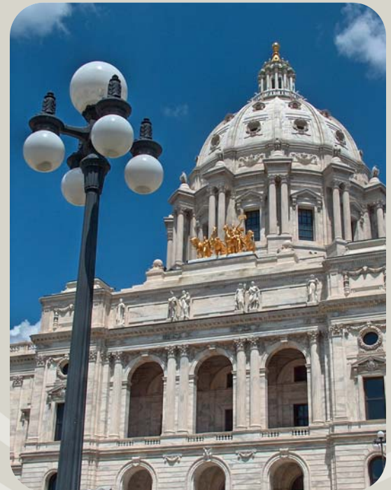
ST. PAUL CAPITOL BUILDING

Staff members from the Higher Education Center also will be providing short group demonstrations of the resources available on the Center's redesigned Web site during the sessions. These 15-minute demonstrations start at 8:30, 9:00, and 9:30 a.m. on Monday, and 2:30 and 3:00 p.m. on Tuesday. No registration is necessary for the Web site tours.