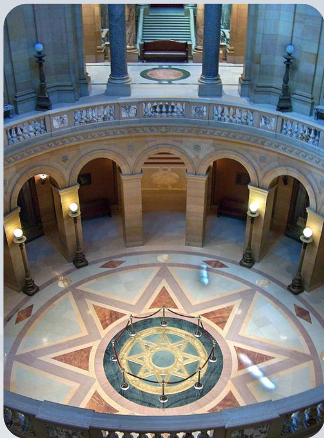
ST. PAUL CAPITOL BUILDING

If you have been a regular attendee, or even if you have only attended one other National Meeting in the past, this message is for you. This meeting will be a new experience even for the seasoned attendee as we widen the lens of prevention to include sessions related to mental health issues and emergency management and response in higher education. Your continued participation in the National Meeting is evidence of your commitment to the field of prevention. As a "veteran attendee" of the National Meeting, we encourage you to make the most of your experience in 2008. The following tips can help you to make the most of this year's event.